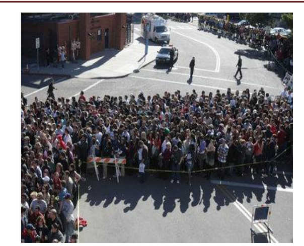
Thousands of People are led by the feather gods in Arizona

http://www.miracleinternetchurch.com/internet-church-videos/the-weapons-of-obedience-